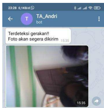
Figure 6. Telegram Display Receiving Photos From ESP32-CAM