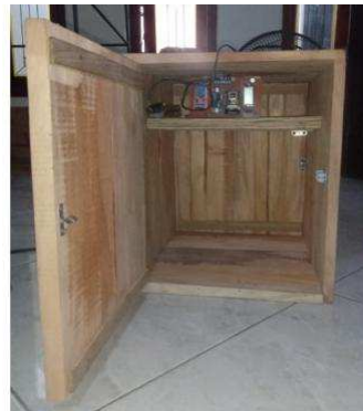
Figure 4. Overall Tool

In this test, a trial was conducted to determine the success of the ESP32-CAM to photograph the object in front of it and send the photo to the user's telegram. The test is done by waiting for the PIR sensor to detect the movement in the locker first, after that the ESP32-CAM will take a photo of the object in front of it and will send the photo to the user's telegram.