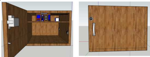
Figure 2. Product Design

In the locker design, the dimensions are 35 cm long, 35 cm wide and 45 cm high. On the front of the locker there is a solenoid as a locker lock and on the inside of the locker there is an empty space as a place for the circuit with the size of the space with a length of 35 cm, a width of 35 cm and a height of 9 cm. While the design on the back of the locker, the security system still uses a conventional key as an emergency door if a problem occurs in the locker.