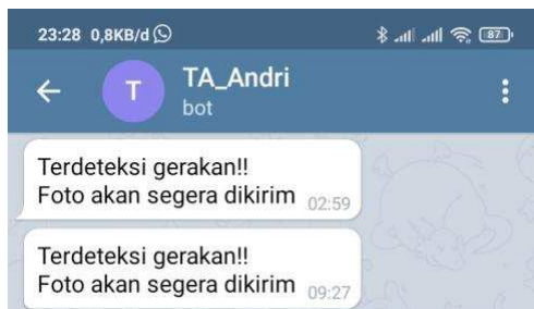
Figure 5. Display When ESP32-CAM Fails to Send Photos