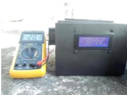
Figure 3. Testing the LCD circuit

LCD (Liquid Crystal Display) is a type of display media that uses liquid crystals as the main display. LCD has been used to display current and voltage sensor readings.