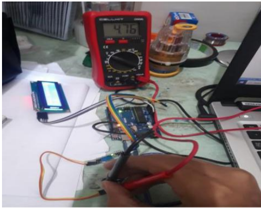
Figure 2 Testing the 5VDC power supply output