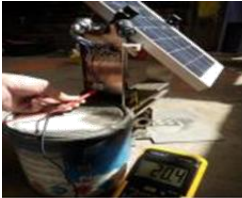
Figure 6. Measurement of the voltage and current of a static solar panel system