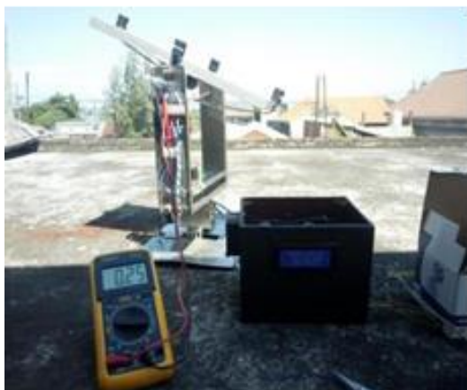
Figure 7. Voltage and current measurements for dynamic solar panel systems

Data obtained from direct measurements on a dynamic solar panel system every 30 minutes from 7 am to 4 pm shown in Figure 7 so that the voltage and current output from the solar panel are obtained.