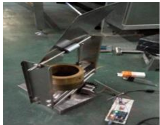
Figure 5. Testing the driver and stepper motor

Testing of the driver and stepper motor is carried out to determine the performance of the stepper motor in making step changes to the program instruction of Arduino Uno.