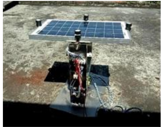
Figure 4. Testing the LDR sensor

The test was carried out by exposing the four ldr sensors to the hot sun and data on what the maximum and minimum values were from the ldr sensor readings.