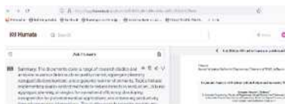
Figure 2. Themes mapping using humata.ai

The last 10 years' effects of artificial intelligence, with an emphasis on supply chain management, robots, quality assurance, predictive maintenance, and operational optimization. Machine learning algorithms provide predictive maintenance, which reduces downtime and maximizes resource allocation. Operational optimization improves decision-making, resource usage, and overall efficiency. It is accomplished by AI's real-time data analysis. Artificial Intelligence (AI) in robotics improves production capacities and advances image recognition and machine learning in quality control processes to guarantee better quality. Artificial intelligence (AI) improves inventories, expedites routes, forecasts demand, and promotes resilience in supply chain management. The revolutionary