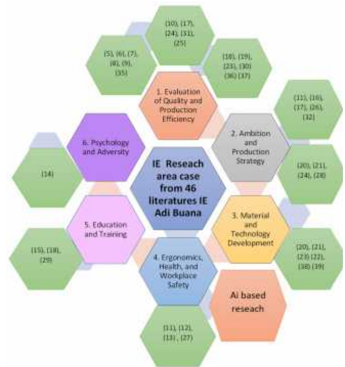
Figure 3. Six BoK mostly used in research IE Adi Buana Surabaya

The last 10 years' effects of artificial intelligence, with an emphasis on supply chain management, robots, quality assurance, predictive maintenance, and operational optimization. Machine learning algorithms provide predictive maintenance, which reduces downtime and maximizes resource allocation. Operational optimization improves decision-making, resource usage, and overall efficiency. It is accomplished by AI's real-time data analysis. Artificial Intelligence (AI) in robotics improves production capacities and advances image recognition and machine learning in quality control processes to guarantee better quality. Artificial intelligence (AI) improves inventories, expedites routes, forecasts demand, and promotes resilience in supply chain management. The revolutionary