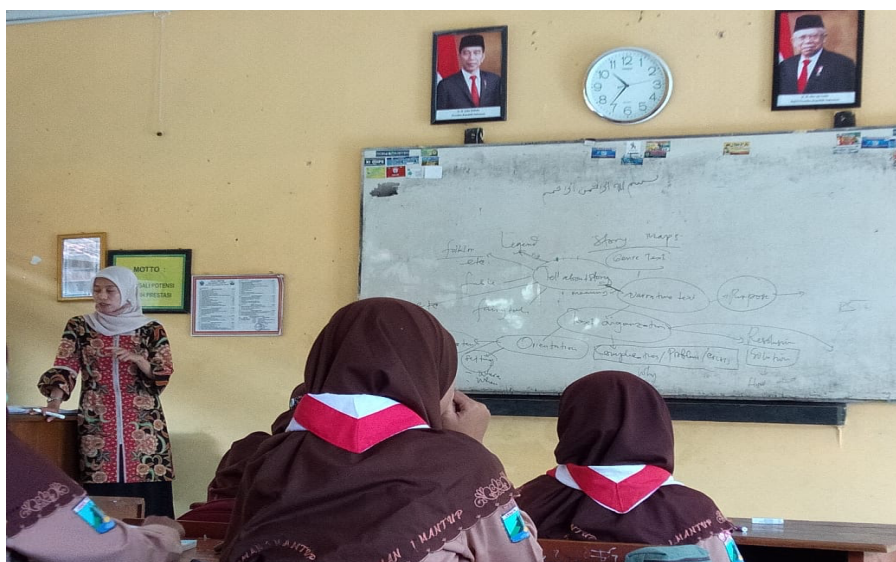
Figure 1. Teacher's explanation about story maps

The researcher used several questions in the questionnaire and interview to know the answer to the first research question, which was about students' perception when using story maps for reading comprehension in class. The questions were intended to know students' perceptions when using story maps for reading comprehension.