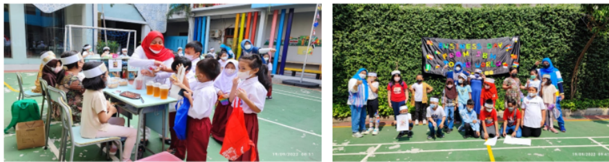
Figure 2. Teacher activities

Today's Independent Building School Business Day activity has the theme "From SBM to The World". As sellers, they are students in class E3, while as buyers, students in grades E1 and E2. Market Day activities for the 2022-2023 school year have been held offline again after two years ago it was held online. The market day concept taken for grades 1, 2, and 3 introduces food and beverages from Indonesia and various continents that exist in the world. A variety of food and drinks are sold such as food from Indonesia there are Sempol Ayam, Dodol Betawi, Getuk, Siomay, mandazi, and karkade tea from the African continent, then there are fried chicken, cookies, hotdogs, and ice cream from the American continent. While from the Australian continent, there is fairy bread, bunning sausages sizzling, lemon squash, and apple pie. Then no less interesting than the Asian continent served dim sum, sushi, toppoki, and so on. Students learn to transact on their own and serve buyers like adults so that when they grow up, they will be ready if they become an entrepreneur. In addition, students can also apply the concepts of mathematics lessons they get in class, such as addition, subtraction, multiplication, and division operations. Learning is not only in the classroom, students interact with other students who have different backgrounds, for example from different religions or tribes. Through this activity, students are trained to be more confident, cooperate and respect others.