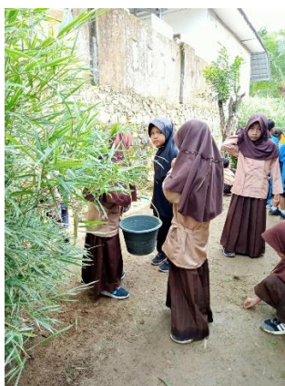
Figure 5. Scout Activities at SDN 1 Nayagati

In addition, as for scout activities and PMR.