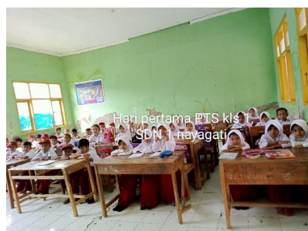
Figure 2. Students at SDN Nayagati 1