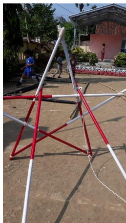
Figure 7. Making a tent gate by students of SDN 2 Bojong Menteng

Based on some of these activities can increase the mental revolution in students. This is in line with research conducted by (Rahman et al., 2021; Sudiami et al., 2019), which states that the scouting activities held can positively impact students in forming a good mentality. Besides being mental, good character is also necessary to promote a mental revolution. In this case, is the character of students who are responsible, polite, and independent (Anisah et al., 2019; Cahyaningsih et al., 2020; Juharyanto et al., 2019; M, Suud, et al., 2020; Masaong et al., 2016; Rahman et al., 2021).