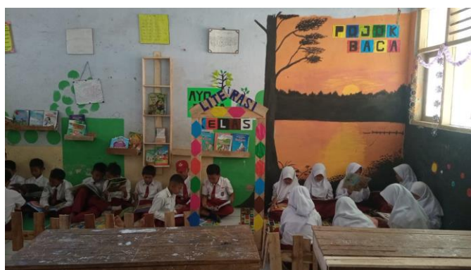
Figure 4. Students at SDN 3 Bojong Menteng

In addition, as for scout activities and PMR.