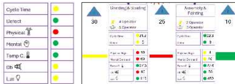
Figure 3: Visualization of Information Block and Material Flow