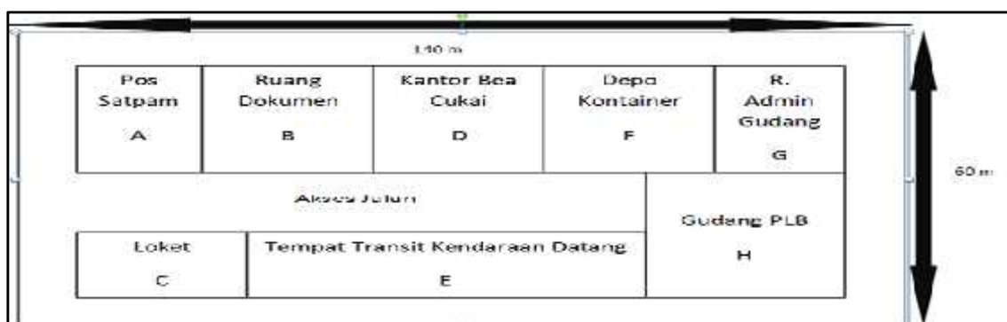
Figure 3. Initial Layout Company PT IJS

PT IJS is a service company engaged in logistics. PT IJS serves several logistical activities in the Surabaya area and surrounding areas. PT IJS is supported by various transportation facilities and equipment that are complete and modern. For logistics activities, PT IJS serves a variety of activities, the main ones being container depots and bonded warehouse rentals (PLB). The following is the initial layout of PT IJS that is directly related to the loading of goods: