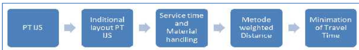
Figure 2 Framework

the main objective is to minimize travel time service within the company by rearranging the company's layout using the weighted distance method approach.