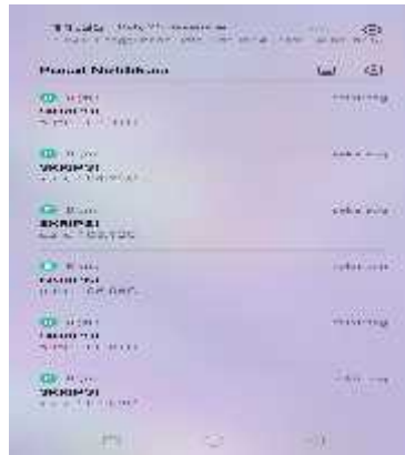
Picture 6. notification image on blynk on a smartphone

As in the picture above shows that the warning notification will be sent to the smartphone every 3 seconds until the temperature of the iron drops below 100°C and the notification will stop to be received.