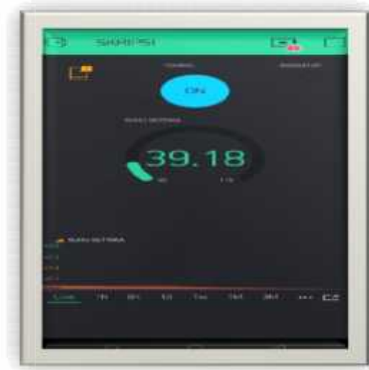
Picture 4. Implementation and testing of the switch screen off