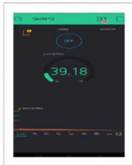
Picture 3. Implementation and testing of the on screen switch

green light indication on the toolbox lights up indicating the temperature of the iron is still below 100 successfully connected. Testing the function of the off button by touching the seven buttons off, the results display an off indication with a red light on the box indicating the data was successfully sent to the Mini D1 wemos and the command to turn off the power source has been successful.