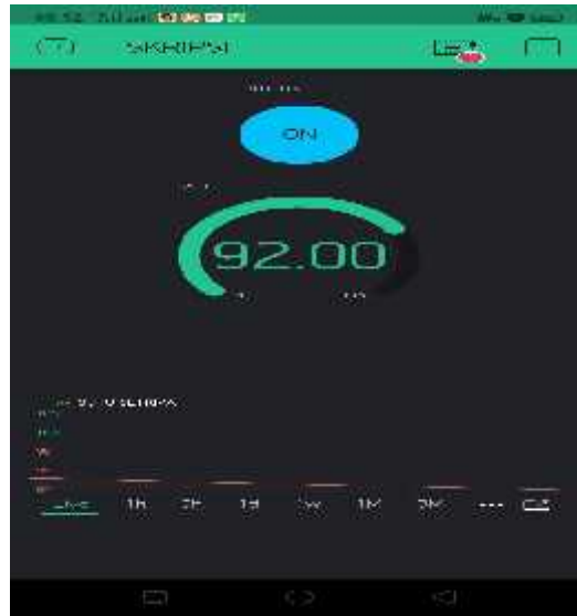
Picture 2. Main menu screen display