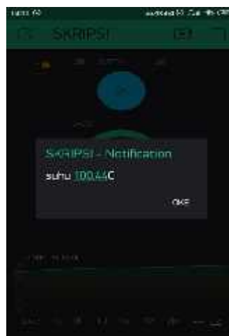
Picture 5. notification image on blynk on a smartphone

The signal will be received once every 3 seconds if there is no command to turn off the power source and the temperature has not reached below 100^{\circ}\text{C} . When the power source is turned off by Blynk, the temperature of the iron slowly drops and reaches a cold point. And the temperature notification will stop being received when the temperature is below 100^{\circ}\text{C} .