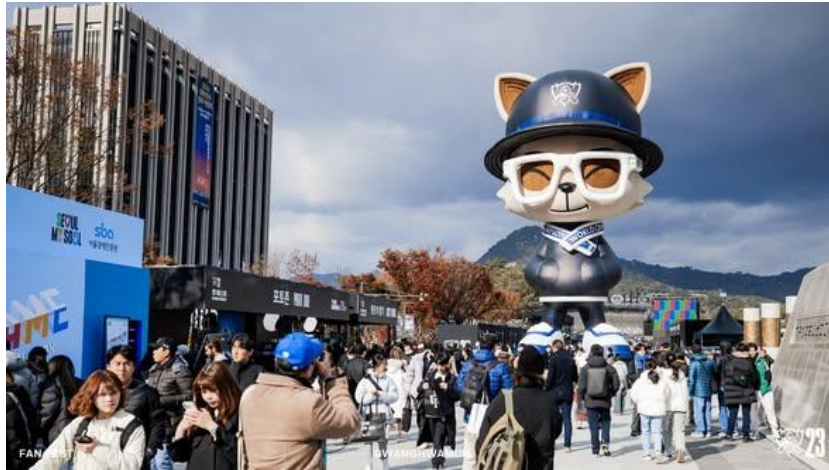
Figure 6. Worlds Fan Fest 2023

education but also through other forms of interaction. Exchange diplomacy can also be understood as interactions through cultural exchanges conducted by many parties, such as an international event, which facilitate a two-way exchange of various individuals and groups from many countries around the world.