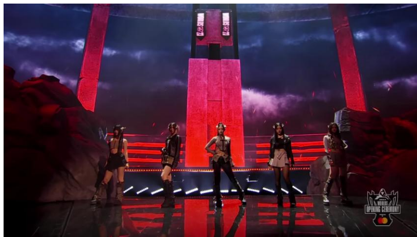
Figure 5. NewJeans' performance at the Opening Ceremony of the LoL Worlds 2023 Final