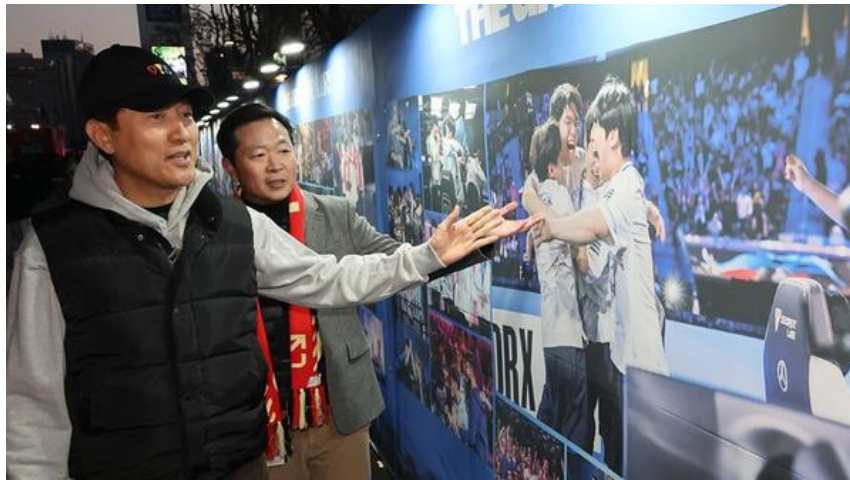
Figure 4. Seoul Mayor Oh Se-hoon Visits Worlds Fan Fest 2023