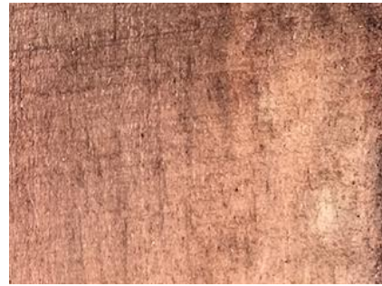
Picture 2 mahoni