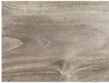
Picture 1 jati