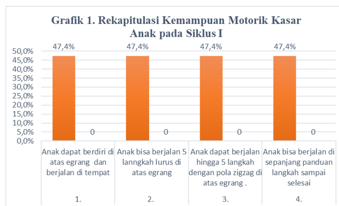
Figure 1. Graph of Achievement of Gross Motor Ability Cycle I

Observations from the initial study showed that gross motor skills did not show good results when the initial action was carried out in cycle 1. It can be seen that children can stand on egrans and walk in place, children can walk 5 steps straight on stilts, children can walk up to 5 steps with a zig-zag pattern on stilts, and the child can walk along the guide steps to completion is 47.4%, which includes the criteria for still developing. The low motor skills of children are caused by the lack of opportunities for students to move and the lack of learning modifications related to gross motor games that can be completed by children aged 5-6 years. In this case, it can be explained in a summary of the criteria for acquiring children, which can be seen in graph 1.